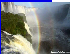
Iguassu Falls : Beautiful Nature.

“This will be a Championship in the Standards of the Itaipu Binational: GIANT and EFFECTIVE .”