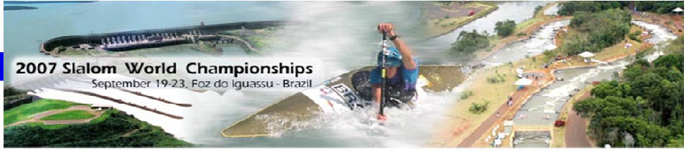
2007 Slalom World Championships September 19-23, Foz do Iguassu - Brazil