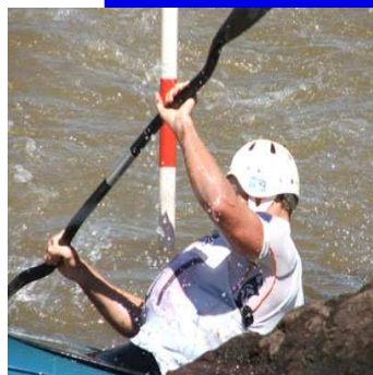
Foz do Iguacu