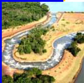
Canal de Itaipu