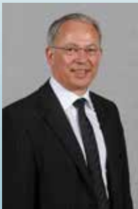
Tony ESTANGUET, Executive Board President